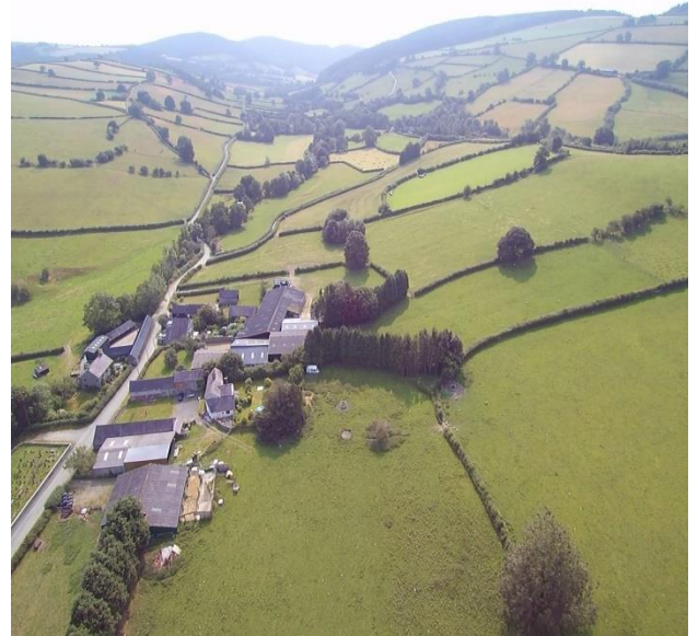
Chapel Lawn in summer.

More information and photos of some of these articles are available on the website at http://www.chapel-lawn.co.uk