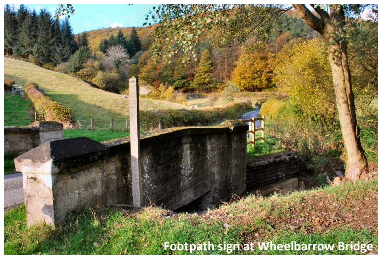
Footpath sign at Wheelbarrow Bridge