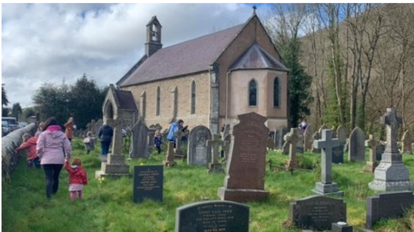
Photographs of the very busy and well attended Easter celebrations in Chapel Lawn this year.

The Redlake is funded by Redlake Valley Hall Funds and neither the hall committee nor the editors can accept responsibility for any opinions expressed by contributors in these pages. The editorial team reserves the right to edit contributions as it believes appropriate.