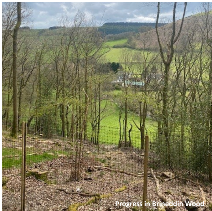
Progress in Brineddin Wood

Thank you also to all the Clun P3 volunteers, many of whom have helped to produce the revised edition of the Clun Valley 33 walks book just published on the 25th March and now available from local shops for £7.95.